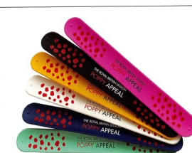
Snap band - Suggested Donation: £1.50

We are proud to be supporting the Royal British Legion in raising money for the Poppy Appeal. Wearing a poppy shows support for the service and sacrifice of our Armed Forces, veterans and their families.