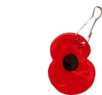
Reflector - Suggested Donation: 50p