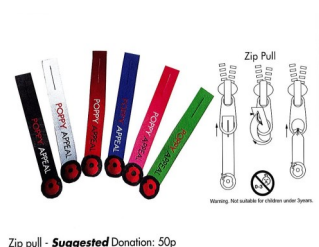
Zip pull - Suggested Donation: 50p