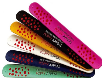
Snap band - Suggested Donation: £1.50