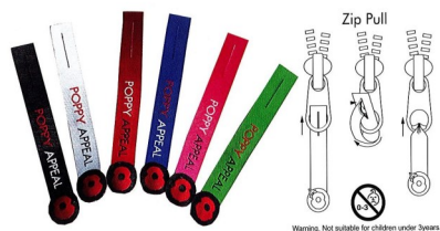
Zip pull - Suggested Donation: 50p