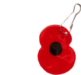
Reflector - Suggested Donation: 50p

We are proud to be supporting the Royal British Legion in raising money for the Poppy Appeal. Wearing a poppy is a show of support for the service and sacrifice of our Armed Forces, veterans and their families.