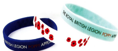
Silicon wristband - Suggested Donation: £1.00

We are selling poppies and other poppy related items from the school office. If your child wishes to buy any items, please send the correct amount of money with your child as we are not able to give change.